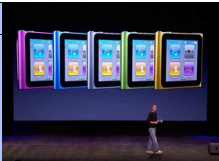
Apple CEO Steve Jobs uses rear projection all the time.

It is the preferred method on large scale conferences, but the technology is there to have it in a smaller event. The downside is that it does require putting the projector behind the screen which can take up a lot of space on your stage. The final look is magical! TM